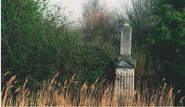
Hawkswood stone erected by the Corporation of Rochester to mark the upstream boundary of the City's fishery.

T he village of Burham as we know it today has evolved over the course of time. Even the street names which we are familiar with have changed throughout history. Edward Hasted, writing in the late 18th Century, stated that the Court Lodge and the nearby church stood close to the river. He also refers to the two hamlets of Great and Little Culing (Culand) on the lower road leading from Rochester to Aylesford, near the former of which were several pits of potters' clay.